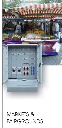
MARKETS & FAIRGROUNDS